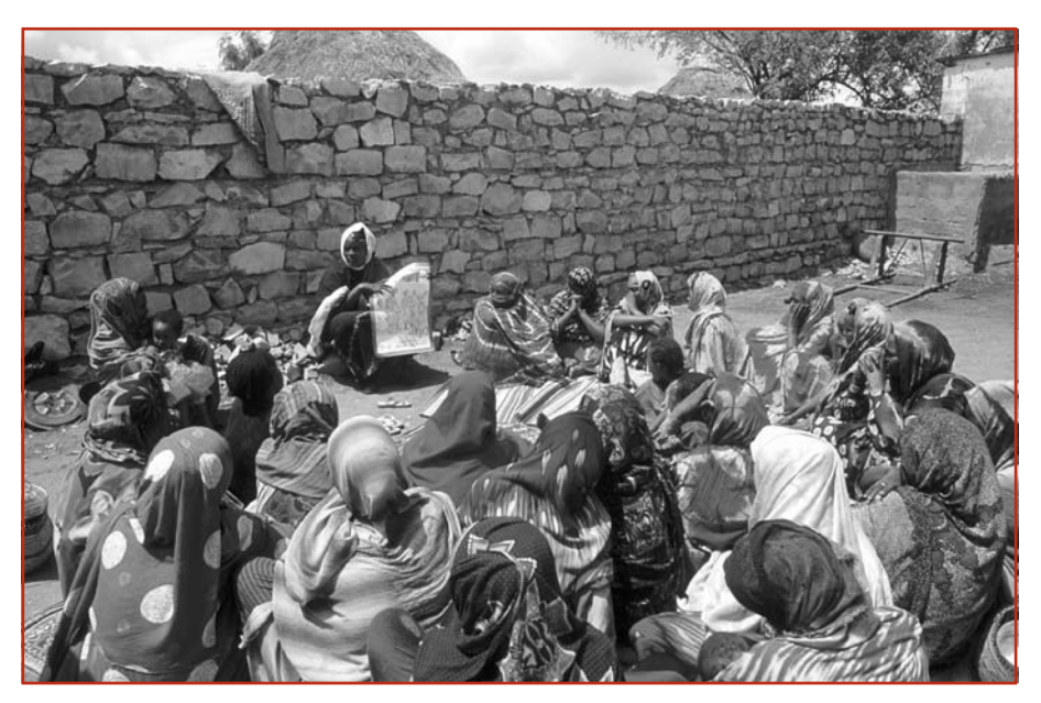
Women in Baidoa, Somalia, being educated about the adverse consequences of female genital mutilation.